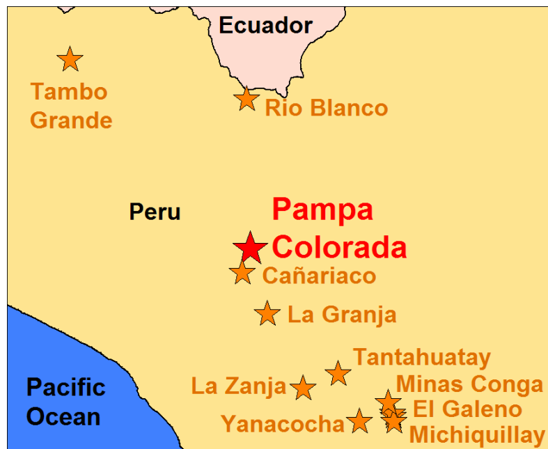
Pampa Colorada location map

Alturas acquired 100% of the Pampa Colorada claim through staking.